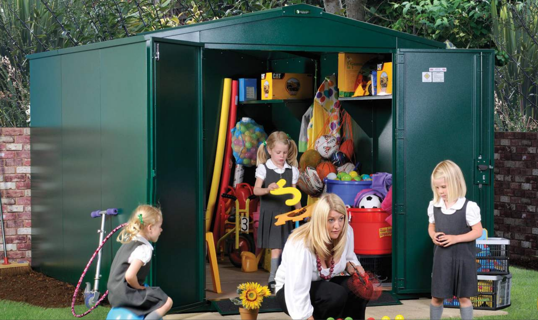
Gladiator Plus 1 School Pack 4